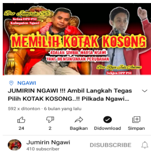
Figure 5. Video content on Jumirin Ngawi's youtube channel containing PSI support for empty boxes.