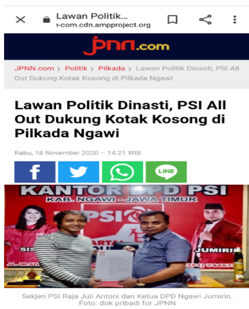
Figure 1. Press news regarding the DPD PSI of Ngawi Regency which stated its support for the empty box.

were indeed dissatisfied with the progress of the previous leadership by supporting the empty box.